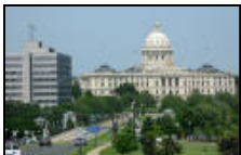
Cover photo shows the Minnesota state capitol building, in St. Paul.

Common abbreviations used in this newsletter: BRCC • Blue Ridge Community College EHHS • East Henderson High School HHS • Hendersonville High School NHHS • North Henderson High School WHHS • West Henderson High School